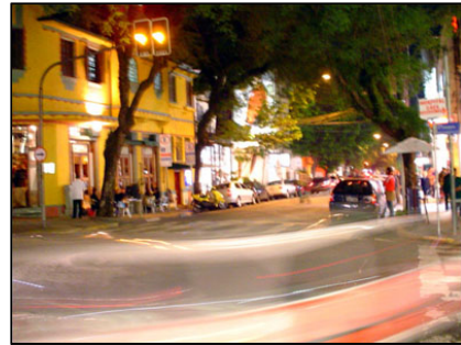
Rua Oscar Freire

I had the impression that the hotel tried to be chic at all costs. It could have been nicer were the approach more pragmatic and practical and still keep its chic and snob appeal.