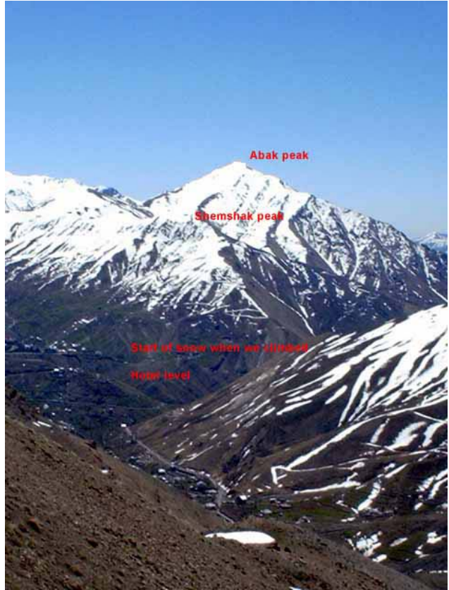
General view of Shemshak and Abak (2 weeks later).